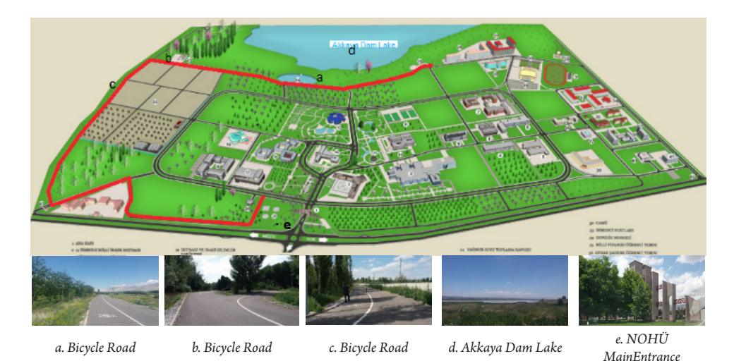
Fig. 4. Bicycle Road Pictures from various side in NOHÜ

cyclists and cyclists, the lack of bike lane and bicycle is the biggest shortcomings of bicycle use. The other two concern are security problem and weather conditions for both groups. Along with bicycle path arrangement preferred use of bicycle is 38% for recreation, 37% for sport and 19% for transportation. The other interesting feedback from all of the respondents is that 87% want to ride a bicycle together with bicycle arrangement. According to stated question about bicycle arrangement the first system that the user will prefer is the Intelligent Bike-Sharing System Free of charge and the second system is the Bicycle Rental System free of charge.