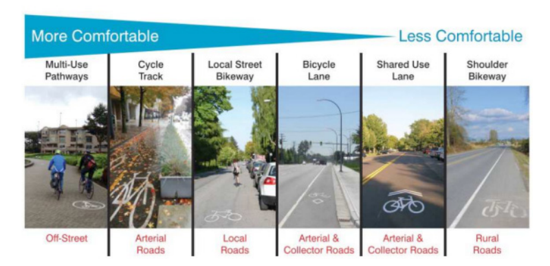
Fig. 2. Bike Facilities

Five types of on-street facilities can be considered throughout a city or region (US, 2015). These facilities are cycle tracks, street Bikeways, Bicycle Lanes, Shared Use Lanes, Shoulder Bikeways that can be seen in Figure 2, from more comfortable than less comfortable features.